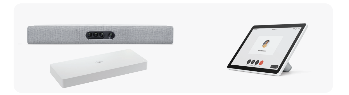
Figure 2. Default components of the Webex Room Kit Plus: Webex Codec Plus, Webex Quad Camera, Webex Room Navigator