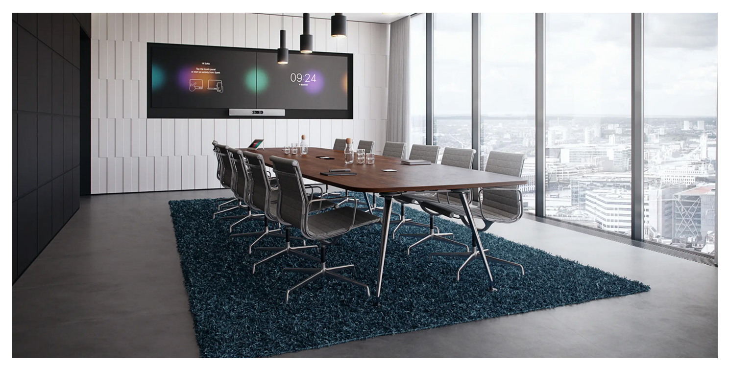
Figure 1. Webex Room Kit Plus in a conference room