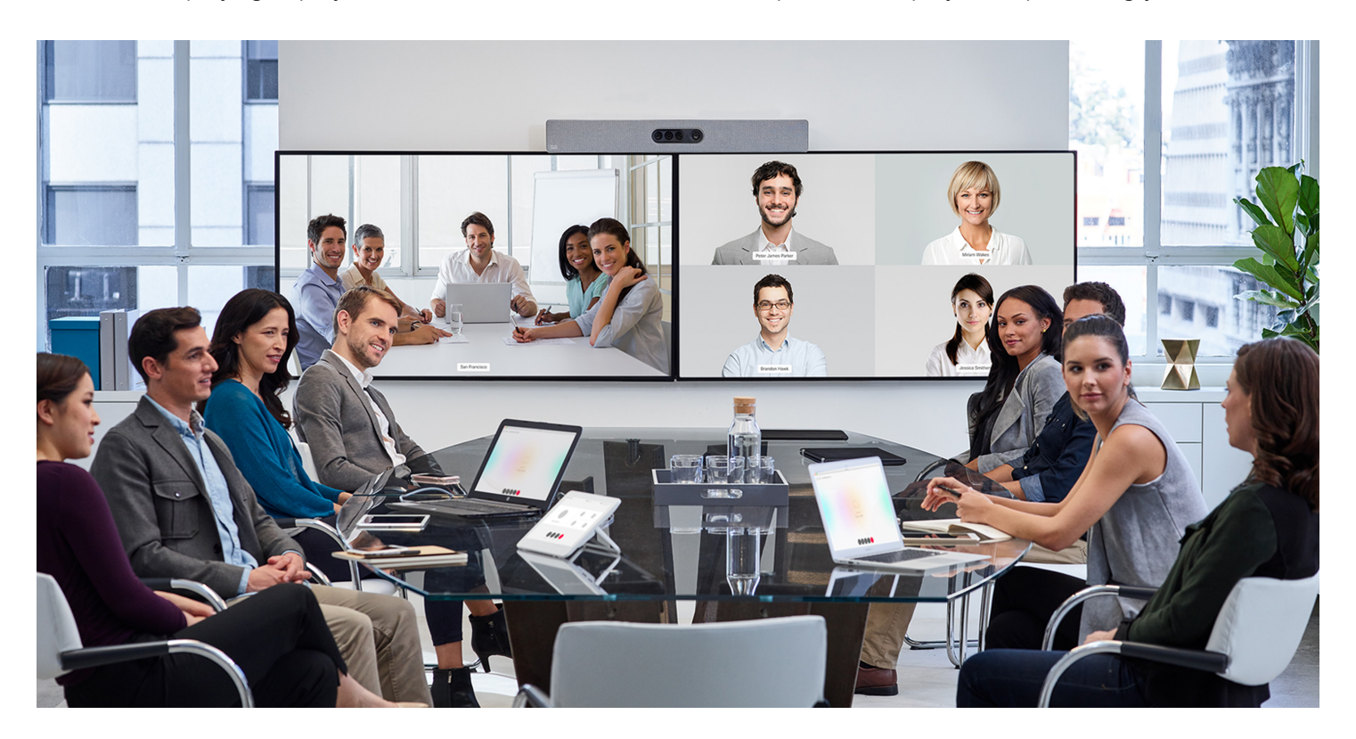
Figure 3. Webex Room Kit Plus in a large meeting room